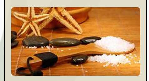
Definition of a Spa – Latin for "solus per aqua"; or you enter by means of water. Others have interpreted this to mean "health through water".

"Making guests feel at home" has long been one of the missions of hoteliers worldwide. Early on, this simply meant offering a clean room with a comfortable bed. Yet, as home amenities and lifestyles have changed, hotels have reacted by adding to their facilities and services. Air conditioning, remote control television, and internet access are now all examples of household trends that have become commonplace in hotels.