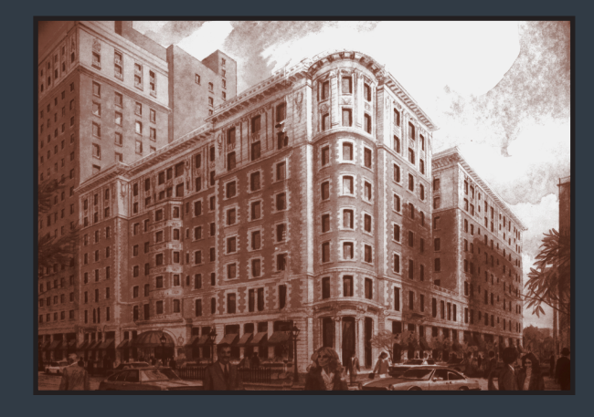
The staff for this world class hotel was provided by Renard International Hospitality Search Consultants